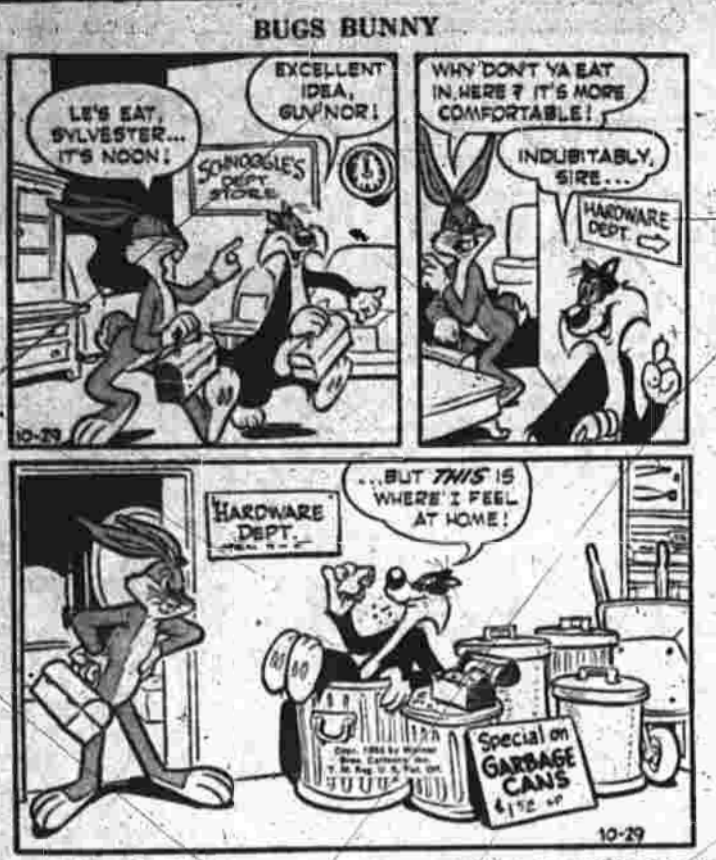
BUGS BUNNY EXCELLENT IDEA! WHY DON'T YOU BUY INSTEAD OF IT? IT'S MORE COMFORTABLE!