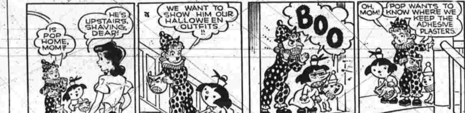
PRISCILLA'S POP Nick Of Time