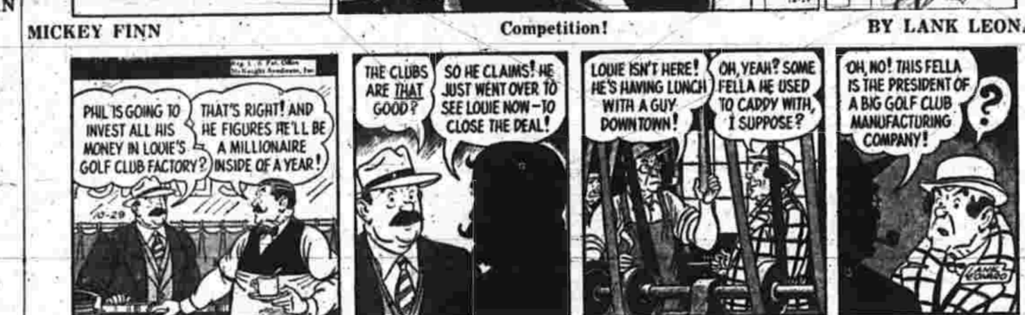
MICKY FINN Competition! BY LANK LEONARD