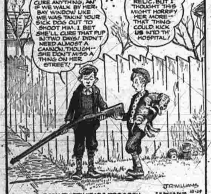
OUT OF MY WAY BY J. C. WILLIAMS

Sense and Nonsense The man who brags about sitting on top of the world should remember it turns over every 24 hours. The Swindlers say: "How are you?" The Swedes: "How can you?"