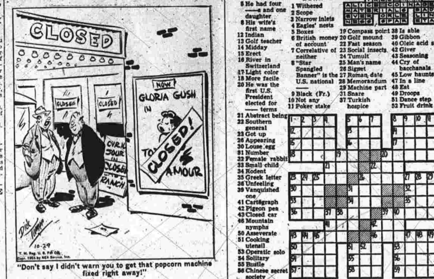
CARNIVAL BY DICK TURNER

32nd U.S. President ACROSS 37 Trial 18 U.S. 38 Weight President's 39 Female sheep mother's 40 first name 41 DOWN 8 He had four 9 River in daughter, 1 Withered 2 Scope 3 Narrow inlet 4 Eagle's nests 5 Bonus 6 British ruler 7 Golf tunic 8 Midway 9 Erect 10 Light color 11 More facile 12 Small out 13 He was the 14 first U.S. 15 President 16 elected for 17 terms 18 Abstract being 19 20 Nations 21 Got up 22 Appearing 23 Lone egg 24 Closed out 25 Female robbi 26 Greek letter 27 Roadster 28 Unreeling 29 Vanquished 30 Carriage 31 Pigpen 32 Clock 33 Mountain 34 Asserative 35 Unusual 36 Seltzer 37 Bull 38 China's special 39 society