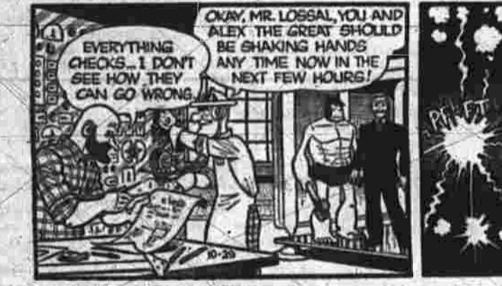
ALLEY OOP BY V. T. HAMILIN